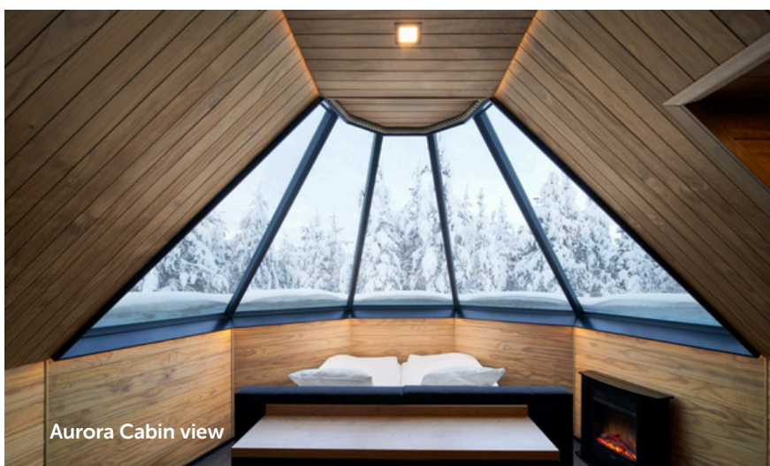
Aurora Cabin view