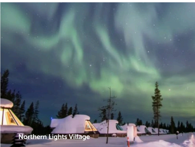
Northern Lights Village

The Aurora Cabins and Aurora Suites at the Northern Lights Village are a magical way to experience the wintry star-filled sky and the Northern Lights, while lying comfortably in the warm bed. The laser-heated glass-roof opens up into the northern sky, directly above the bed.