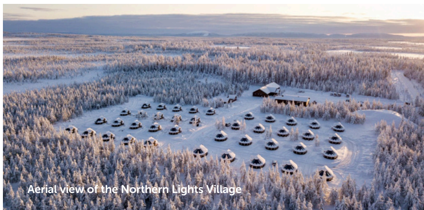
Aerial view of the Northern Lights Village